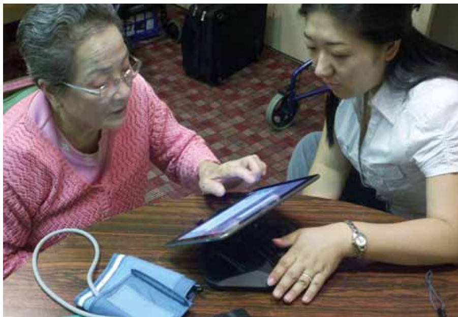
A Korean elder is trained on using remote patient-monitoring equipment in Los Angeles, California

Therefore, the FPCTIW sought to “empower as many Koreatown residents as possible with health information,” says Park, with a multipronged, technology-