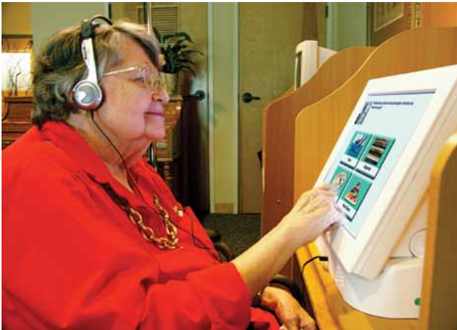
A woman uses the Dakim BrainFitness System. The Front Porch Center for Technology, Innovation and Wellbeing partners with this company to provide the technology to constituents