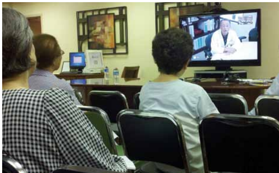
Older adults listen to a video conference workshop on diabetes at an affordable housing community in Los Angeles, California